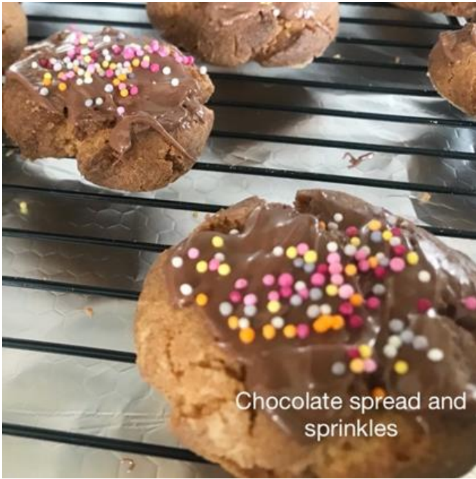
Chocolate spread and sprinkles