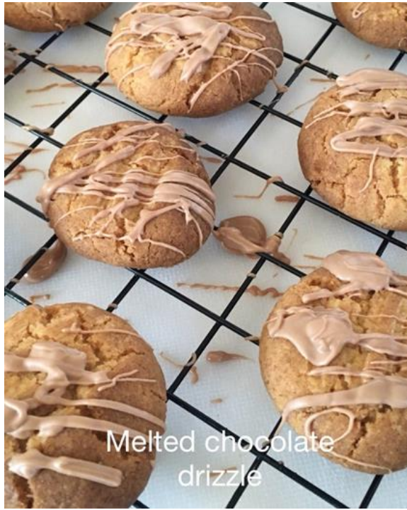
Melted chocolate drizzle

These are two ways we've decorated these at home - We'd love to see yours, don't forget to email over a photo of your finished biscuits!