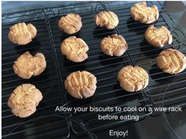
Allow your biscuits to cool on a wire rack before eating