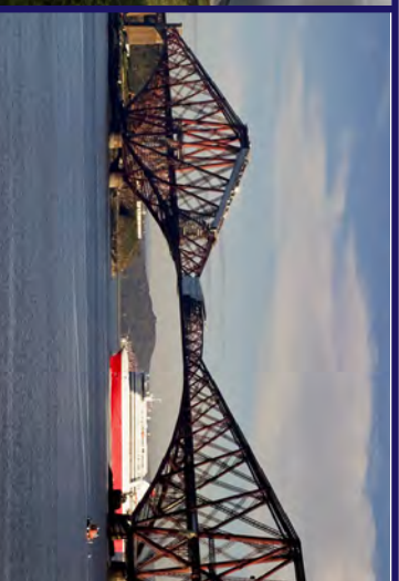
Forth Railway Bridge