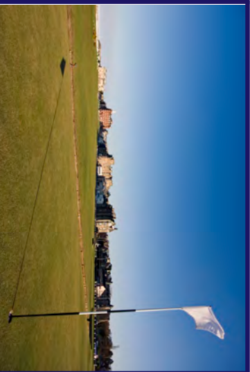
St Andrews Links