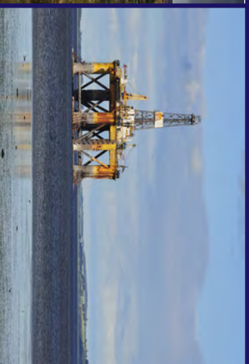
North Sea Oil Field