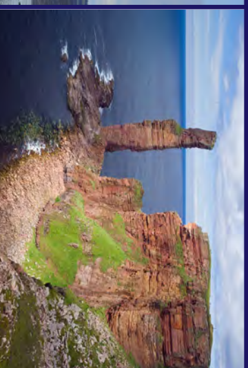
Old Man of Hoy