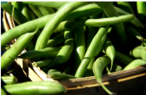
Green beans from Kenya

They look after herds of cows, sheep and goats on the savanna.