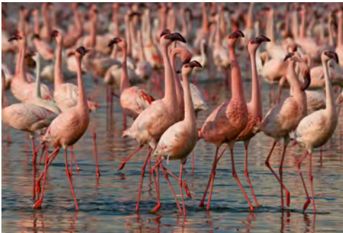
Pink flamingos in Lake Turkana

Kenya also has big cities, with tall buildings, shopping malls and busy streets.