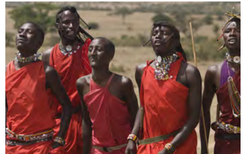
Maasai boys jump as they dance

The Maasai tribe of Kenya wear bright clothes and jewellery.