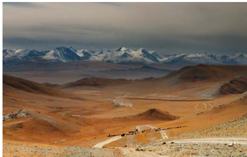
Desert in Mongolia

The Sahara Desert stretches all the way across North Africa.